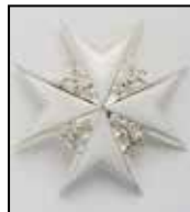
Knight of Grace