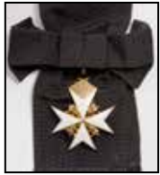
Bailiff Grand Cross

Upon admission into the Order of St John, members are presented with insignia, each level and office being depicted by different emblems and robes for wear at ceremonial occasions. Notes on the wearing of insignia are available on request from headquarters.