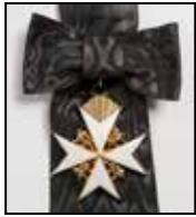
Dame Grand Cross