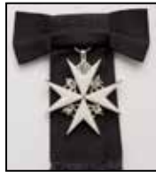
Dame of Grace