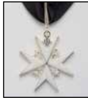
Knight of Grace