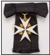
Dame of Justice