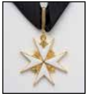
Knight of Justice