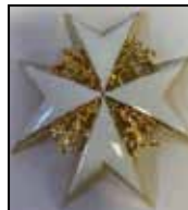
Knight of Justice