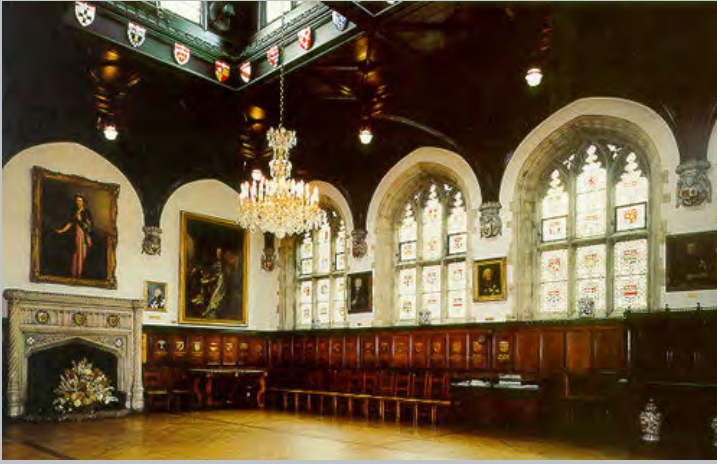
The Museum of the Order of St John Chapter Hall

On Friday 3 November the Venerable Order hosted a meeting of Johanniter (St John) organisations from 7 countries across Europe (known as the Alliance).