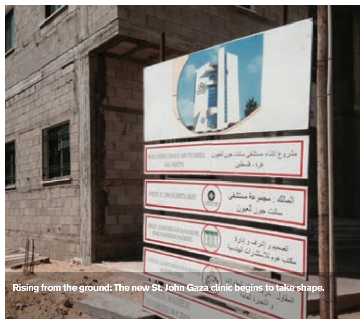
Rising from the ground: The new St. John Gaza clinic begins to take shape.

Now that we have completed a substantial part of the new clinic, we have been able to go back to our main sponsor, the Emir of Qatar, and, as a result, we have just received a generous donation towards running costs.