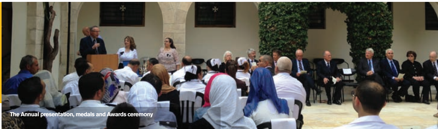
The Annual presentation, medals and Awards ceremony